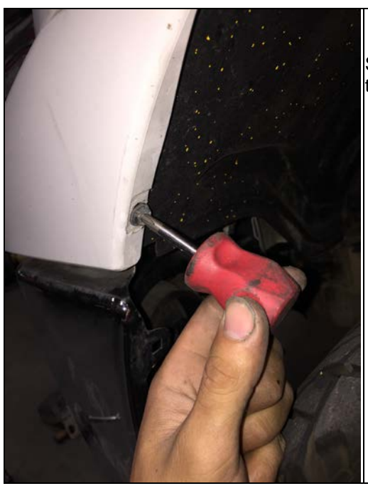
Step 6.) You can use a Philips screw driver or 10mm socket to remove the other bolt in the fender well.