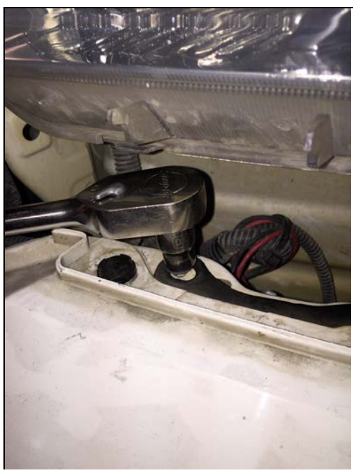
Step 7.) There are also 4 bolts on each side underneath the headlights, these need to be removed and saved for reinstallation.