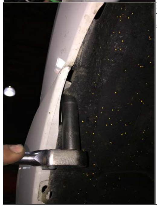
Step 5.) Remove the bolt in the inner fender wheel well. This is a 10mm bolt and can be removed with a racket and socket.

Step 4.) Now you have access to the top plastic bumper valance and assorted plastic clips remove the four plastic clips you now have access to, under the head lights.